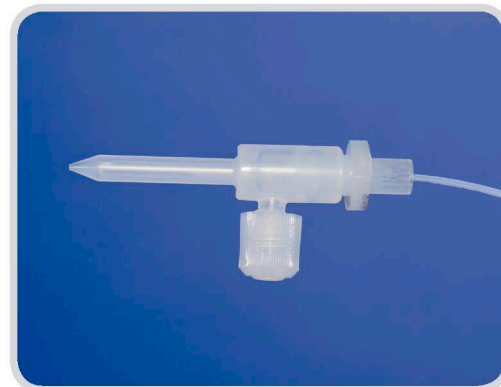
Savillex PFA C-Flow Nebulizer

The design of the C-Flow features a unique two-piece construction, which allows for very precise assembly and optimization of argon back pressure. This is key because back pressure directly impacts droplet size and signal sensitivity. The design also gives better reproducibility in performance than any other microconcentric nebulizer. This is especially important for the lowest uptake rate nebulizers, which are the most challenging to manufacture. As a result, C-Flow target uptake rate ranges are narrower than any other microconcentric nebulizers. The two-piece C-Flow design also offers additional benefits: because the capillary is supported all the way to the tip, all C-Flows can be backflushed safely without risk of damaging the capillary, and lifetime is significantly increased compared to other PFA nebulizers. All C-Flow microconcentric nebulizers feature a uniform capillary ID all the way from the sample to the tip, giving better than expected tolerance to particulates and high TDS (total dissolved solids). Finally, C-Flows are manufactured in both conventional and desolvator versions, which allows for optimum performance at the widely different operating temperatures of both applications.