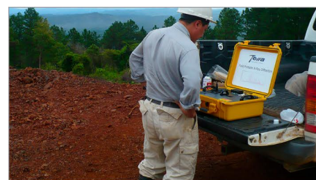
Figure 1. The world-class Greenbushes Li-Ta-Sn LCT pegmatite in Western Australia; an Olympus Vanta™ portable XRF analyzer used for geochemical mineral exploration (upper right); an Olympus TERRA® portable XRD for mineralogy (lower right).